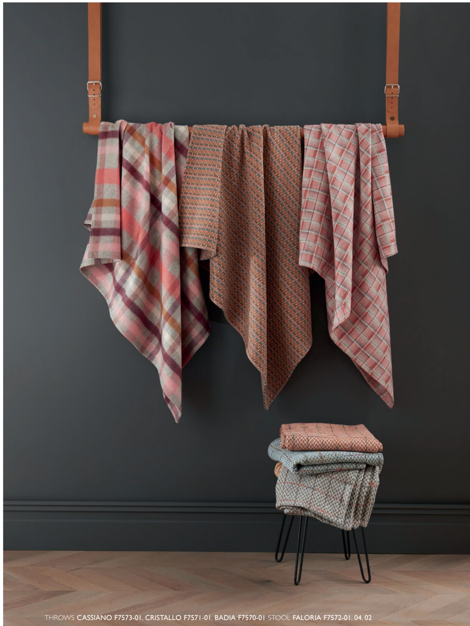
THROWS CASSIANO F7573-01, CRISTALLO F7571-01, BADIA F7570-01 STOOL FALORIA F7572-01, 04, 02