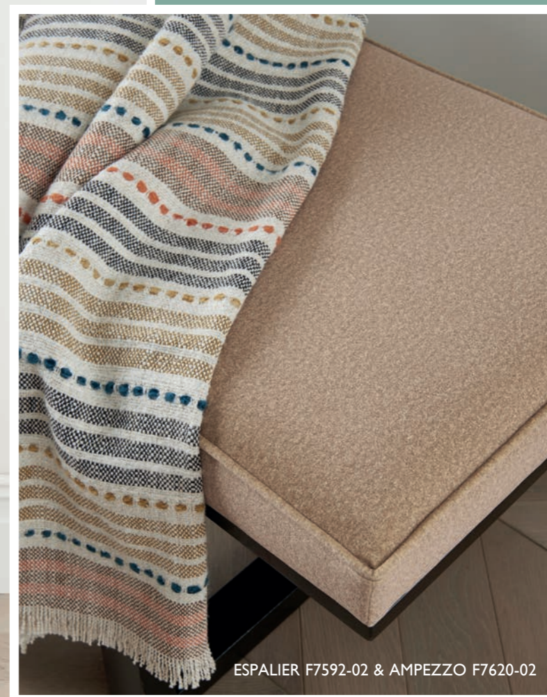
ESPALIER F7592-02 & AMPEZZO F7620-02

A contemporary design of colour co-ordinated vases displaying ivory stylised flowers and foliage is illustrated in crewelwork. Amphora is the name for an ancient Greek jar or vase.