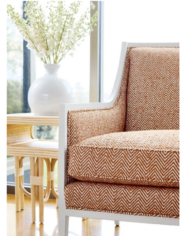
Pasadena Chair in Monviso