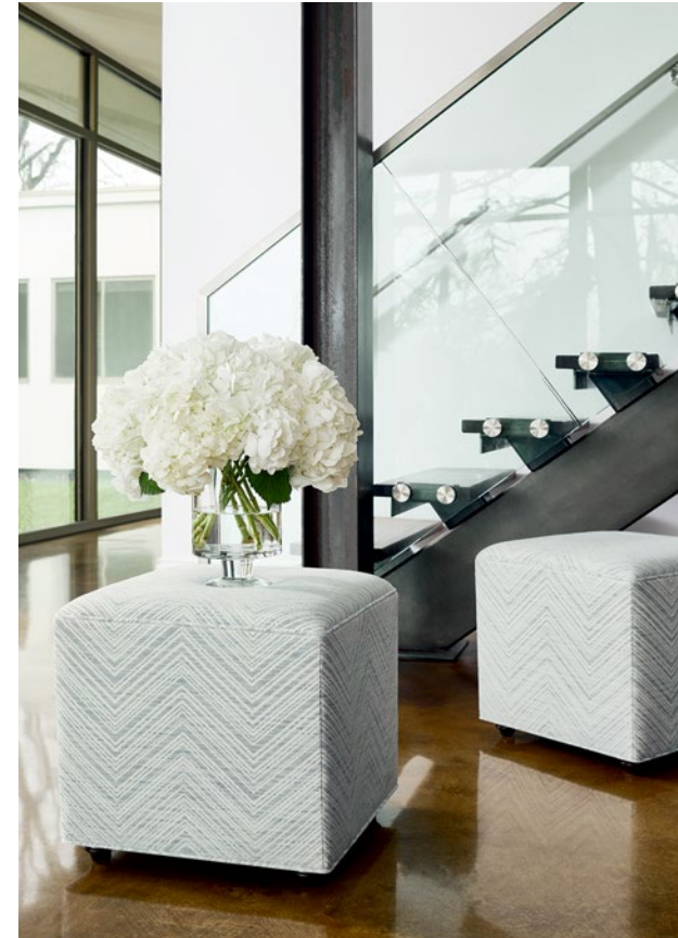
Fair and Square Ottomans in Monti Chevron