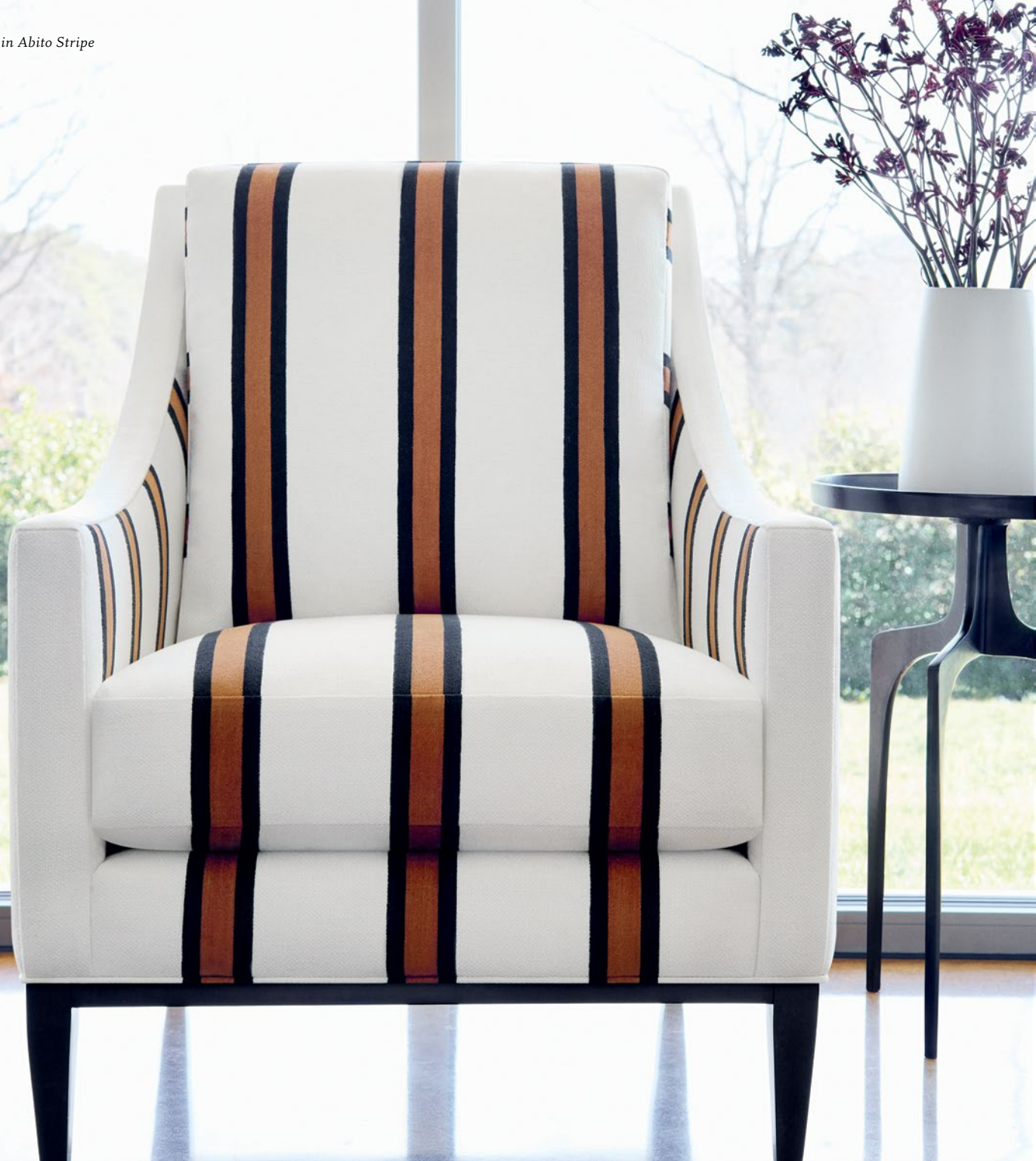
Carson Chair in Abito Stripe