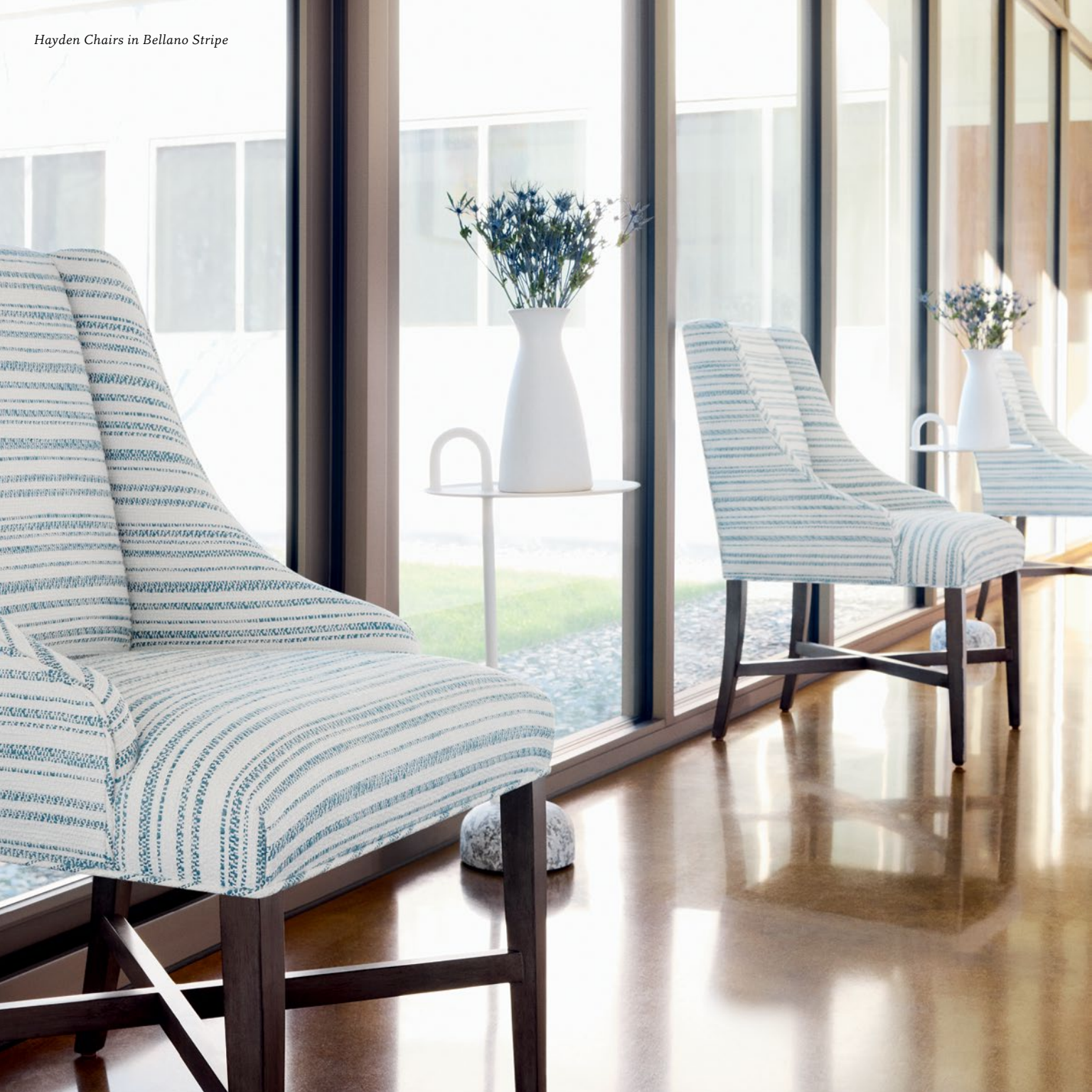
Hayden Chairs in Bellano Stripe