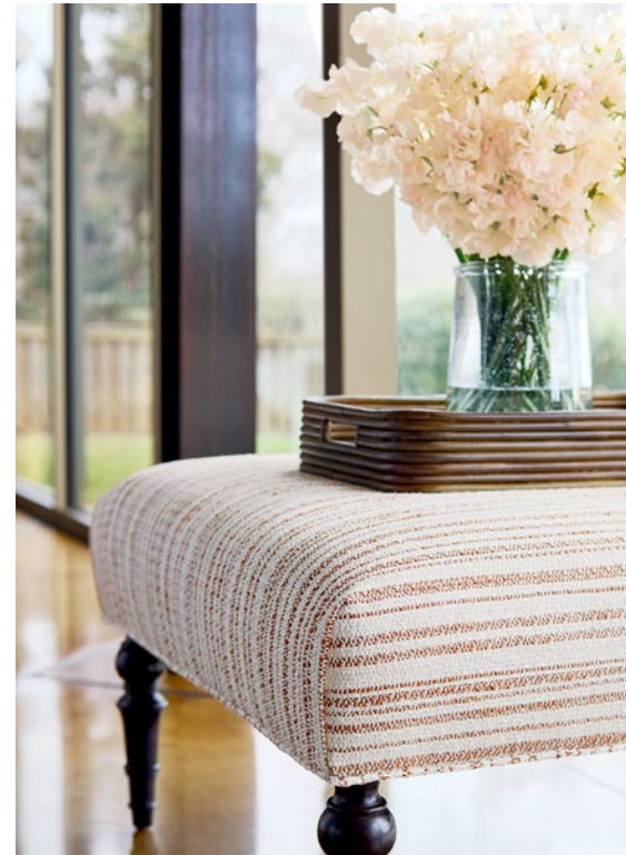
Baxter Ottoman in Bellano Stripe

Veneto is a collection of luxurious woven fabrics made in Italy. Chunky weaves and nubby textures pair with mineral-inspired colors from alabaster to azure and topaz to clay and copper. Veneto introduces over 50 frame-ready fabrics with plush grounds and visual texture, woven with the finest materials and made to last with an added stain repellent.