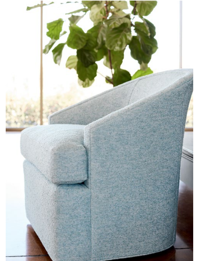
Dexter Chair in Sasso Texture